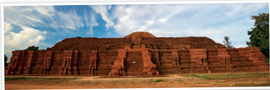
Khlang Nok Ancient Monument

Dvaravati style was discovered, which was later changed into a Hindu temple during the early 13 th century, but was not finished; it was similar to Prang Si Thep. Moreover, an ancient pond called “Sa Kao” outside the town to the north, and “Sa Khwan” within the outer town were discovered. Both are still full with water throughout the year. The water inside is believed to be sacred and has been utilised in the Oath of Allegiance Ceremony up to the present time.