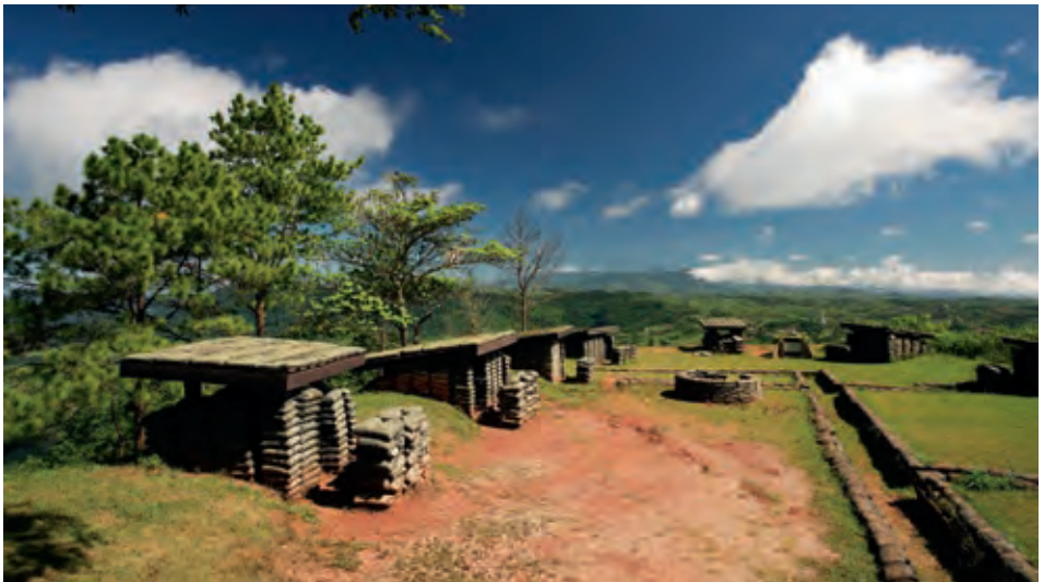
Than Itthi (Weapon Museum)

is situated a bit after kilometres 28 on Highway No. 2196. Turn right into Highway 2323 for 3 kilometres. It is a viewpoint where beautiful scenery can be seen and was once an important strategic base in the past. At present, it is a weapon museum, displaying the cannons, military tank remains and weapons used in the battle on Khao Kho. There is also a briefing