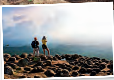
Lan Hin Pum

are living places for members of the Communist Party of Thailand. It comprises many villages such as Muban Dao Daeng and Muban Dao Chai. Each village contains around 40-50 houses lined up in a dense forest along the road cutting from Lom Kao District. They are small wooden houses on the ground. The roof is made of thin wooden boards which can protect against the rain. Besides, there are air-raid shelters.