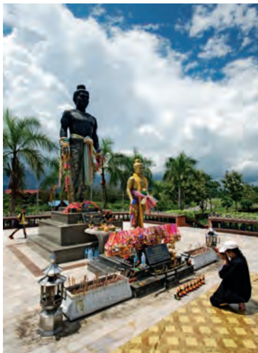
Pho Khun Pha Mueang Memorial

Second Route: From Phitsanulok, take Highway No. 12, Phitsanulok-Lom Sak Route, for approximately 100 kilometres and turn right