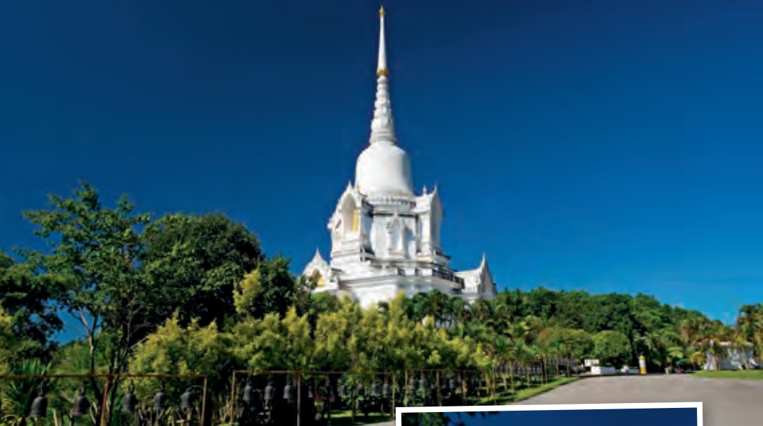
Phra Borommathat Chedi Kanchanaphisek

room for a group visit. It is open daily, costing 10 Baht a person.