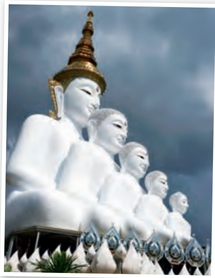
Wat Phrathat Pha Kaeo

is a research centre on the breeding of wildlife in Khao Kho (a project under the Royal Initiative), which is operated by the Wildlife Conservation Office, the Department of National Parks, Wildlife and Flora in accordance with the Royal Initiative of Their Majesties the King and the Queen influenced by their royal visit to Khao Kho. Moreover, the Wildlife Conservation Division has established a Wildlife Breeding Centre, as well as, the Khao Kho Open Zoo, covering an area of 20 square kilometres in Khao Kho Sub-district, Sado Phong Sub-district and Nong Mae Na Sub-district in Khao Kho District. Wildlife bred and propagated at the centre can be categorised into 3 types; namely, mammals, birds, as well as, reptiles and amphibians. There are 3 bungalows provided for tourists at