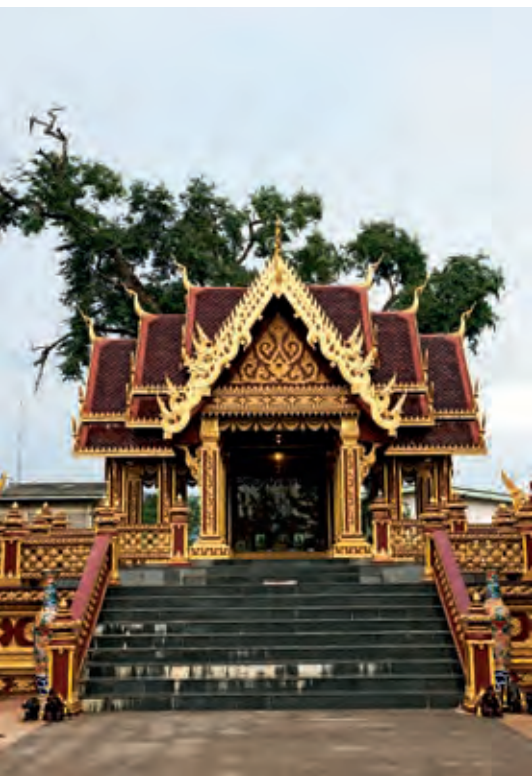
The Phetchabun City Pillar Shrine

century. Therefore, the city pillar is considered as the most ancient one in Thailand.