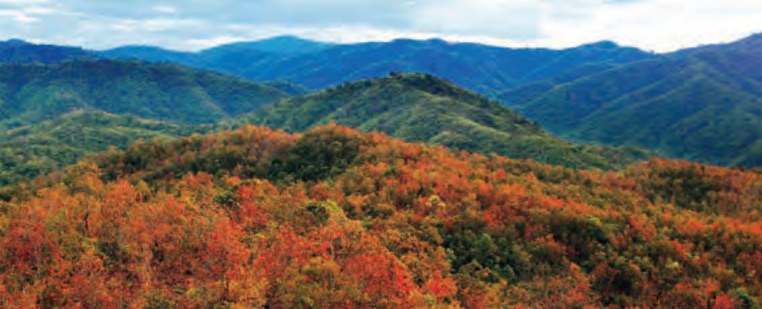
Nam Nao National Park