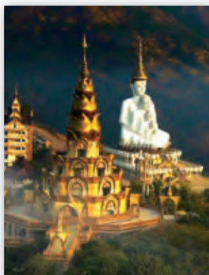
Wat Phra Dhat Phasornkaew