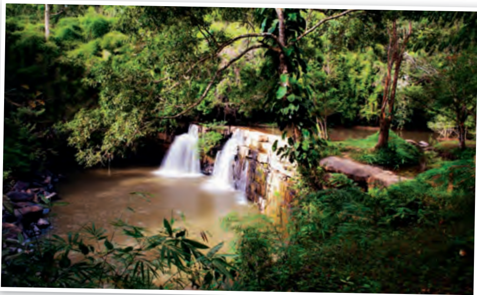
Namtok Si Dit

2196, 28 th Cavalry Division and bungalows for accompanying persons near the Khao Kho Palace and Khao Ya. Moreover, there are many resorts by the route ascending to Khao Kho.