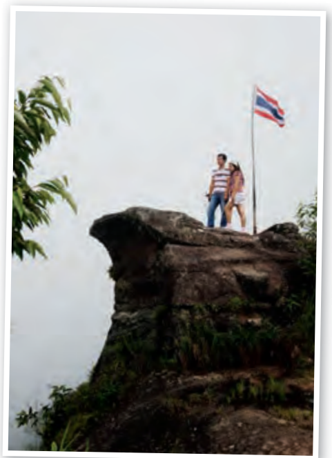
Pha Chu Thong

was named as such to be a memorial to the soldiers from the Si Phatcharin Camp in Khon Kaen, the first army unit coming to Phu Hin Rong Kla. The waterfall is 20 metres high with a large basin in which visitors can swim.