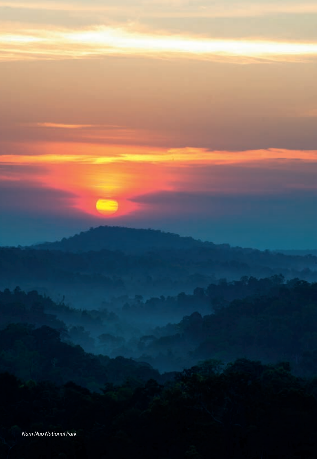
Nam Nao National Park