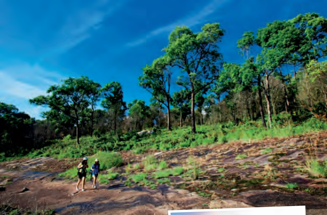
Lan Hin Taek

make them difficult to be discovered from the air-observation. There are many shelters but only two are open to the public. One is 200 metres from the Political and Military School. It is a big cave with complex gap and corners for 500 persons. The other one is at the entrance of the Headquarters Building, capable of containing 200 persons.