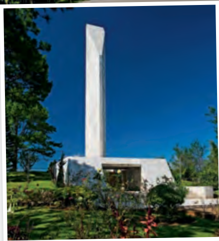
Khao Kho Sacrificial Monument

To get there: Take Highway 2196 until Kilometres 28. At the T-junction, turn right to Highway 2323 for 3 kilometres, being a total distance of 31 kilometres.