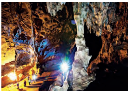
Tham Yai Nam Nao (Phu Nam Rin)

Its entrance is at Km. 60 along Highway No. 2211, Ban Huai Sanam Sai-Lom Kao District-Ban Non Chat Route. At the arrival to Ban Hin Lat, there will be a path to Tham Yai Ranger Station. Tham Yai Nam Nao is located on a 955-metre-high mountain. It is a big cave within the limestone mountain where there is a splendour of stalagmites and stalactites. The most bizarre characteristic is the water flowing within the cave, where there are natural chimneys through which sunlight shines, and which is a habitat of a flock of bats. This cave is very deep; therefore, it has not yet been thoroughly explored.