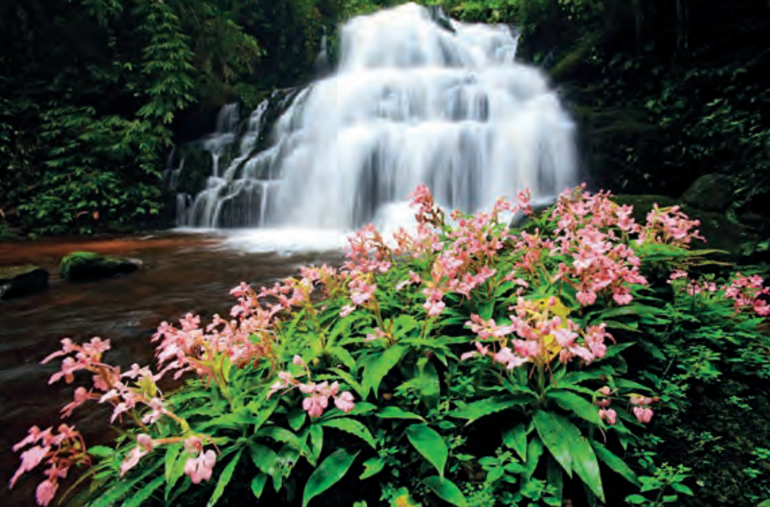
Namtok Man Daeng