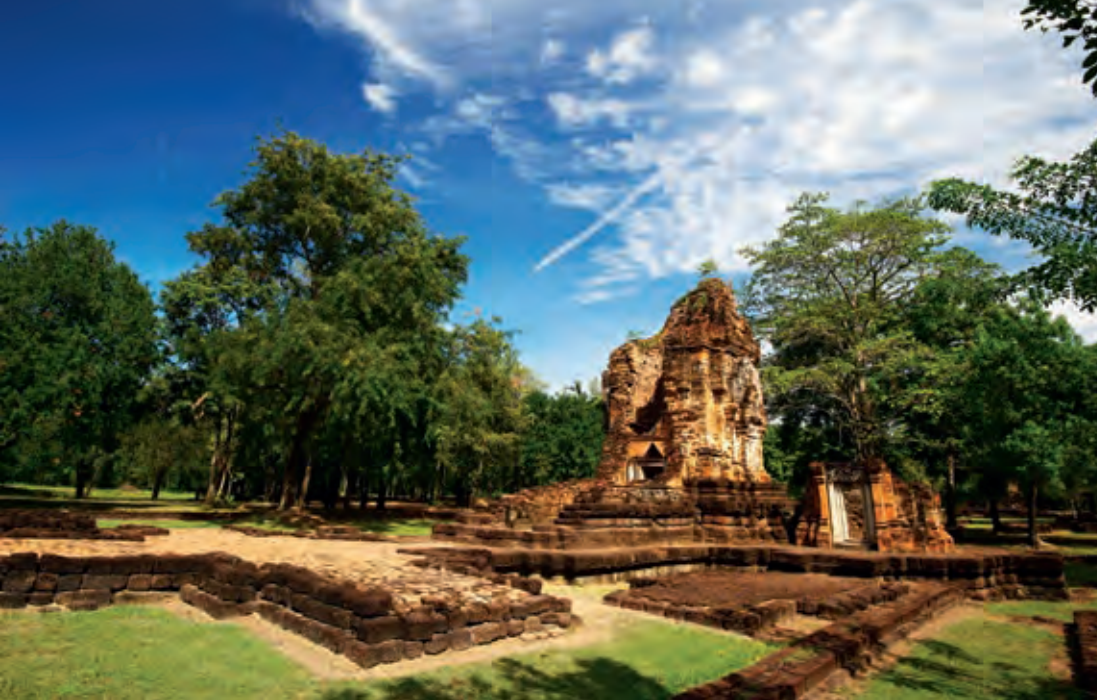
Si Thep Historical Park

Thep Ancient Town, which was originally called “Mueang Aphai Sali”, believed to have been constructed during the prosperous time of the Ancient Khmer Empire, aged not less than 1,000 years.