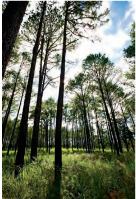
Tung Nang Phaya

is a savanna grass field mixed with mountain pine forest, located in the middle of the National Park at the summit of Khao Khok Son. It is similar to Thung Salaeng Luang and Thung Nang Phaya. From the end of the rainy season to the beginning of winter are various kinds of flowers that bloom such as Utricularia delphinioides , Doritis pulcherrima , Eriocaulon henryanum , Arudina graminifolia , and Nepenthes . This field is appropriate for trekking and is 31 kilometres from the Office of the National Park at Nong Mae Na. It is open to the public during October-