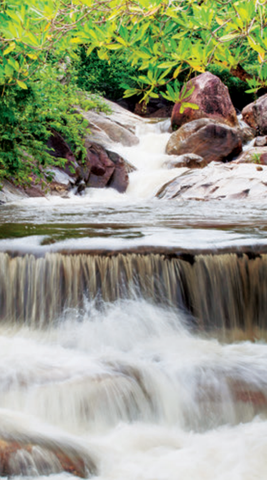
Namtok Kao Chan

turn back to the office, taking 3 hours. Each route has nature interpretation signs. For more information, please call Tel. 08 1107 0086. At Bangkok, please contact the Office of H.R.H. Princess Maha Chakri Sirindhorn's Suan Chitrlada Royal Project at the Chitralada Villa Tel. 0 2281 3921, 0 2282 6511 ext. 22