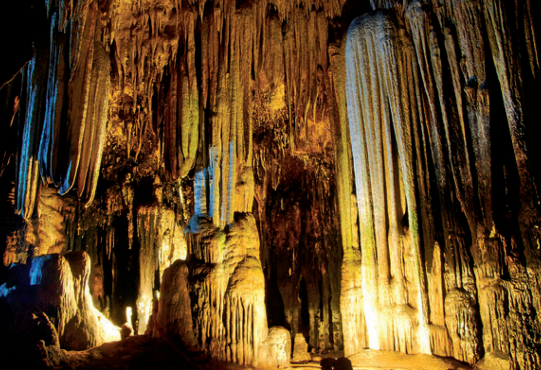
Tham Khao Bin

You can see the small mountain where a gorgeous cave known as Tham Sarika is situated. King Bhumibol gave the name to this place when he visited and enscribed his royal initials at the entrance of the cave.