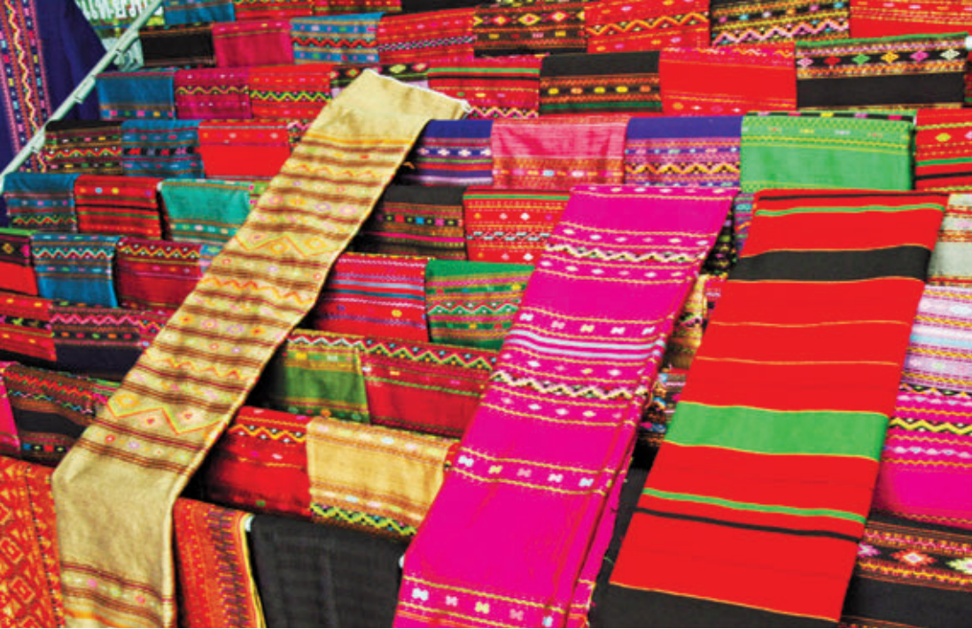
Pha Sin Tin Chok

Pha Sin Tin Chok (ผ้าซิ่นตีนจก) is the elaborate clothing handicraft of Thai-Yuan which we can see and buy at: