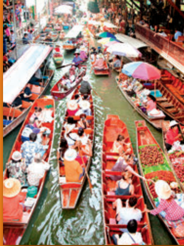
Damnoen Saduak Floating Market