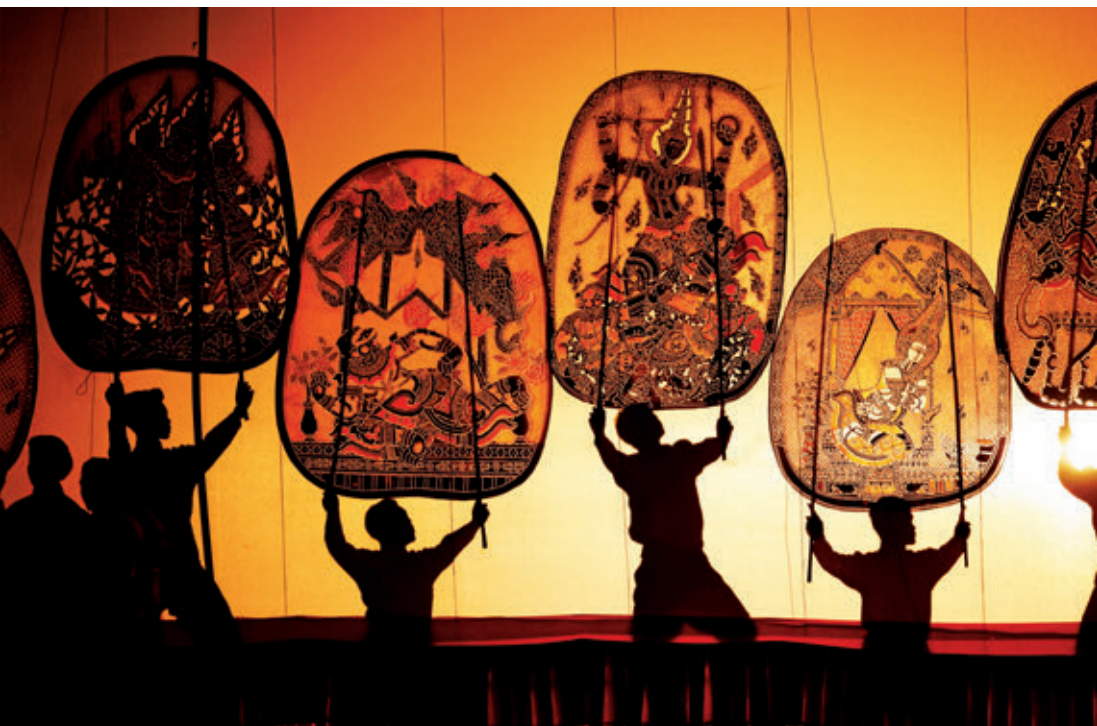
Nang Yai Museum Wat Khanom

by students from Wat Khanon School only once a week on Saturdays at 10.00-11.00 a.m. (To see the show on weekdays, please contact in advance. Admission is Bt2500 per show. For more information, please contact the Abbot of Wat Khanon at Tel. 0 3223 3386, 08 1753 1230 Fax. 0 3235 4272.