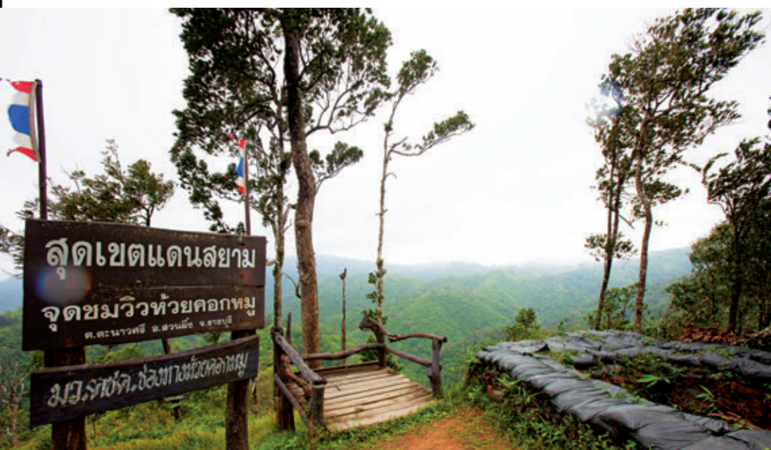
Huai Khok Mu

At present, the Tanao Si Sub-district Administration Organization, in cooperation with the Border Patrol Police Sub-division 137, has developed the area to welcome tourists who love adventure tourism and off-road journeys. This is where we can see the beautiful sight of