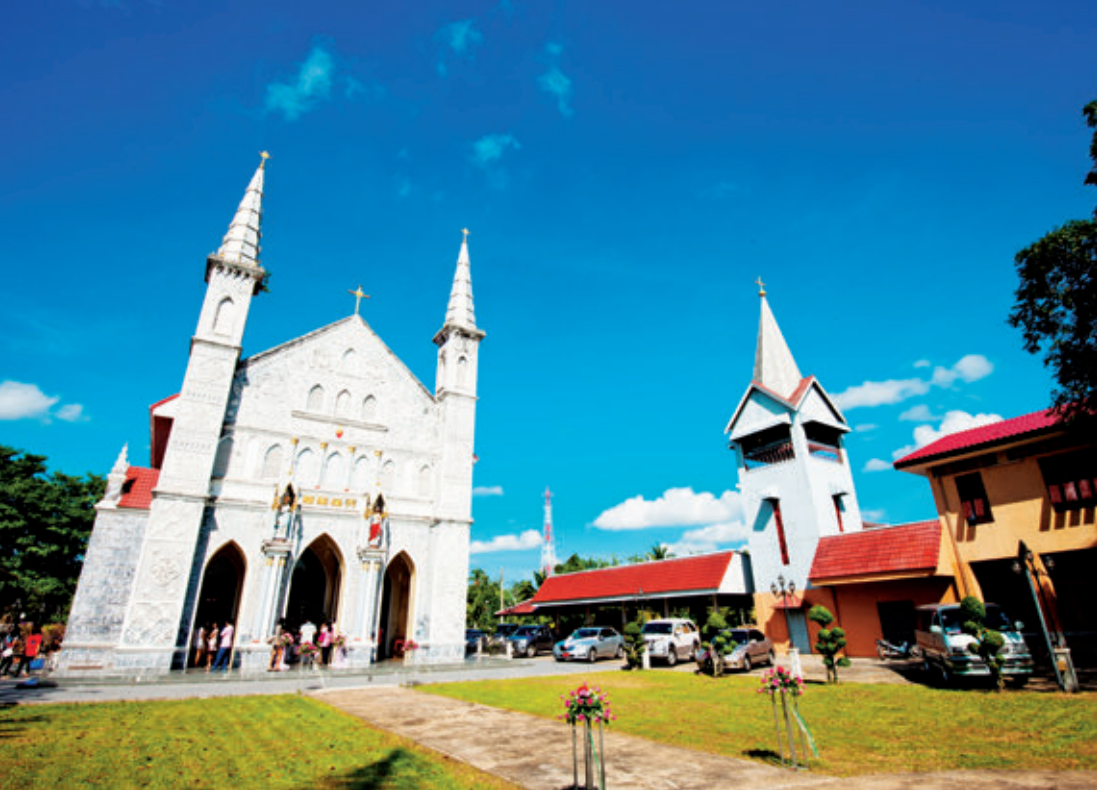
Sacred Heart Church

ceremonies by the people living in the area. During his reign, King Rama V visited the temple and gave royal tributes; such as, a container for keeping tobacco. Other interesting things include a replica of King Ramkhamhaeng's inscription stone, a Buddha image in the posture of giving blessing, and the Buddha's footprint which is enshrined in Wihan Luangpho Ruesi.