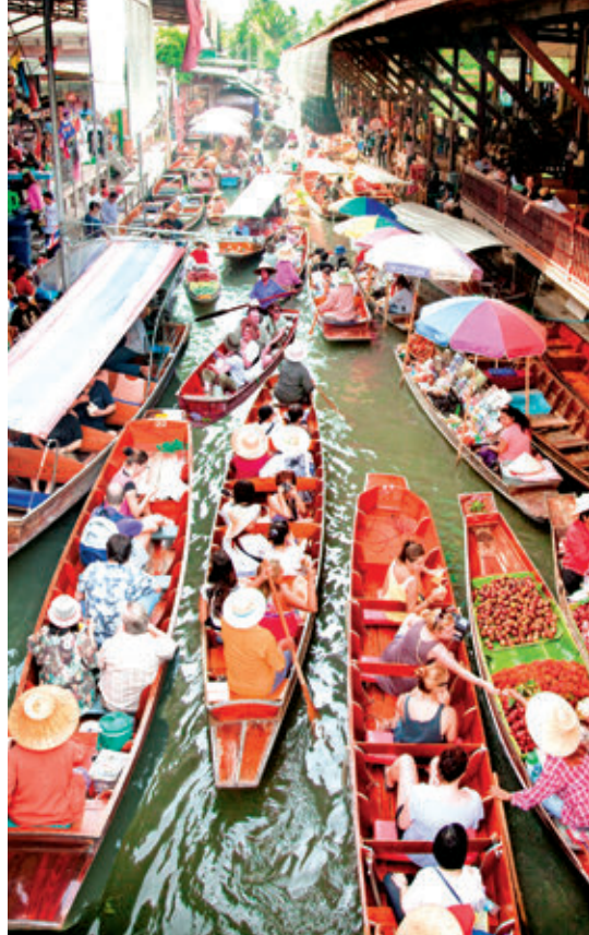
Damnoen Saduak Floating Market

is situated in Tambon Phaengphuai, on Bang Phae-Damnoen Saduak Road. From Bang Phae, the temple is on your left, 10 kilometres. before you arrive at Damnoen Saduak Intersection. The temple's ordination hall was constructed near the end of the Ayutthaya era, and it was the place to keep jade Buddha images in different gestures. Inside the temple, the learning garden and royal permanent forest garden is located with an area of more than 200 rai (320,000 square metres). This temple received the 1st prize for the outstanding forest garden from the Royal Forest Department in 1996. In addition, it is the provincial Pali language school. There is an exhibition concerning Lord Buddha's relics and instruction of meditation and practice of Dhamma for Thais and foreigners is given on Sundays at 9.30 a.m.–2.30 p.m. The training course will be held for 2 groups each year during 1-14 May and December. For further details, please call Tel. 0 3274 5180 ext. 191, 220, 08 6306 0920 or www.dhammadakaya.org