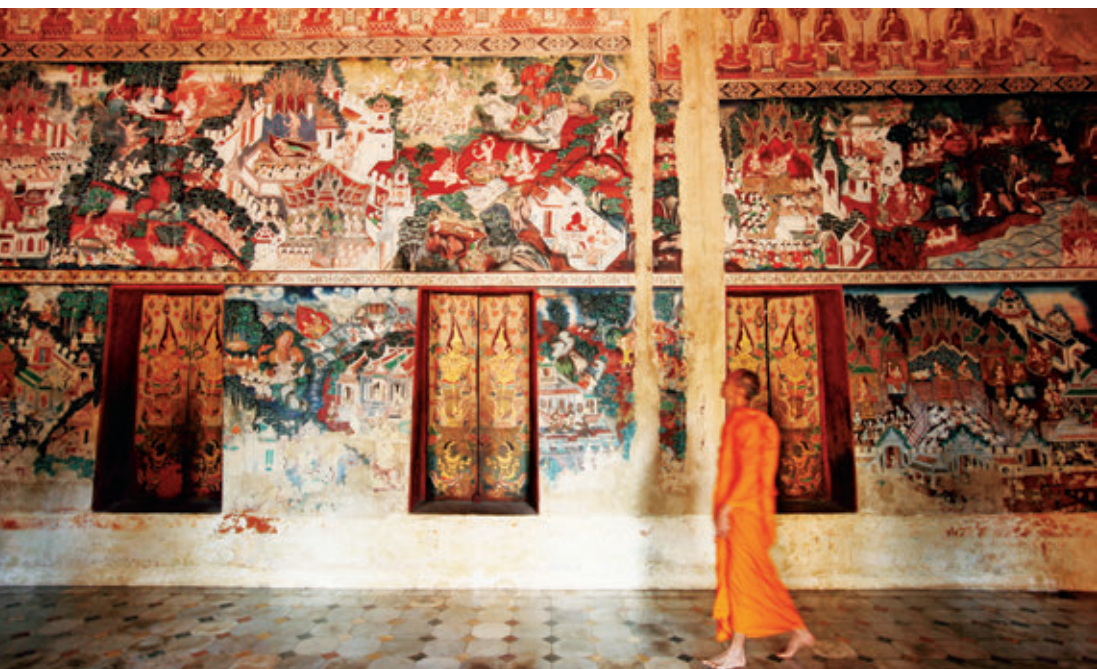
Murals at Wat Khongkharam

more than 200 years ago. Formerly, it was called “Wat Klang” or “Pia To”; later, King Rama V gave the new name “Wat Khongkharam”. The temple consists of the Phra Ubosot, or the ordination hall, surrounded by 7 Mon-style pagodas. In the ordination hall, the gilded principal Buddha image, whose axis is made of laterite, is situated. The base of the Buddha image is made in a form of combined upturned and overturned lotuses. The murals were made elaborately since the beginning of the Rattanakosin era. Each painting seems to be animated and tells the history of the Lord Buddha, which can be rarely seen. In addition, a typical Thai monk’s cell with 9 rooms, built in the Thon Buri Period, is now changed to be the folk museum. It is the place to collect artefacts relating to the local area in