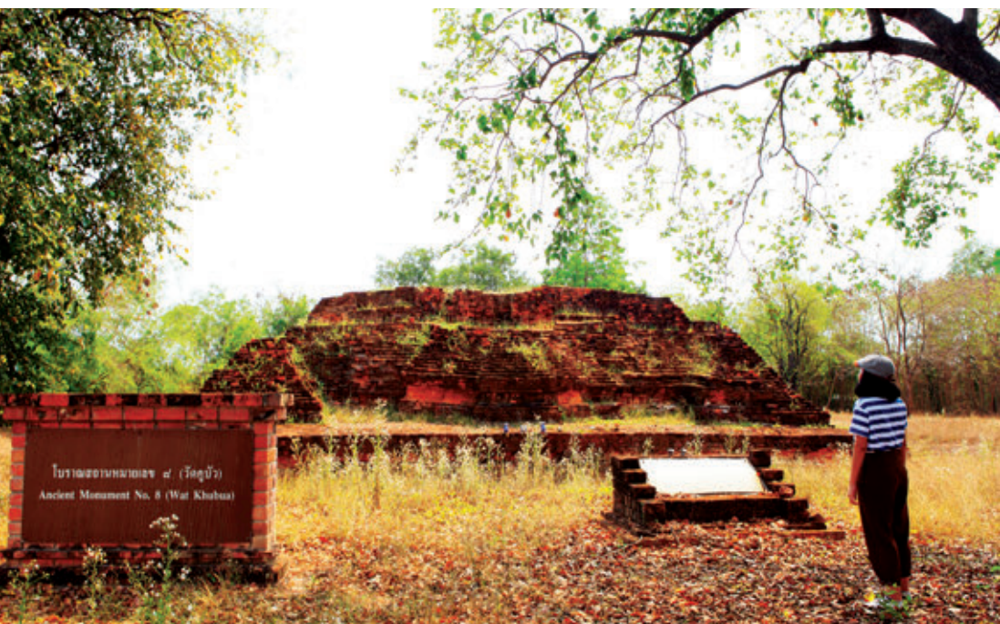
Ancient Monument No.8