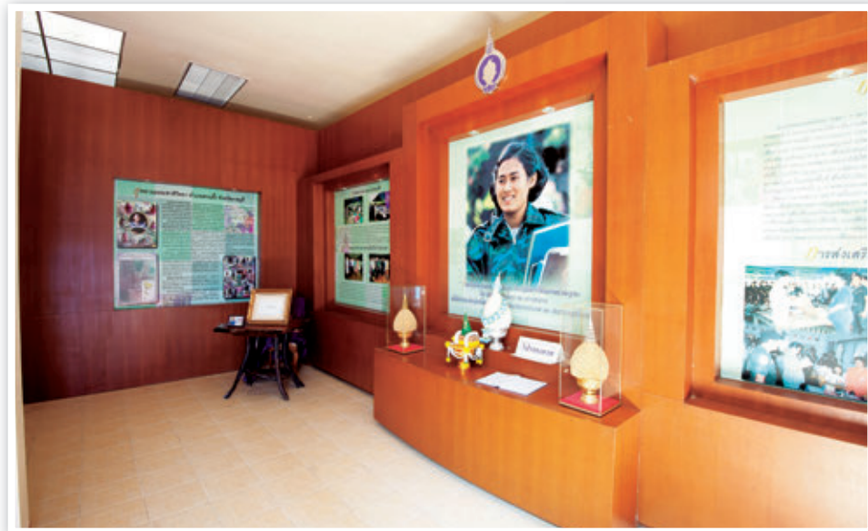
Natural Science Park

Admission is Bt5. For more details, please call Tel. 0 3232 9025, 0 3271 1086.