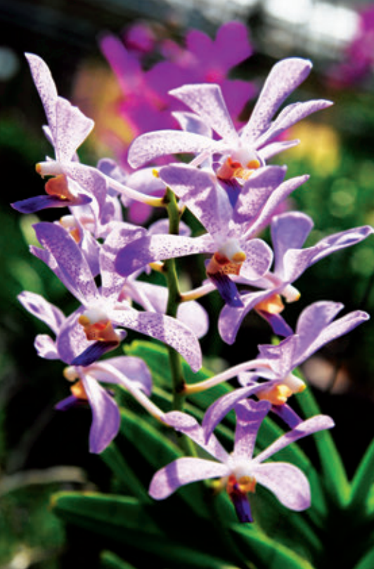
Suan Phueng Orchid