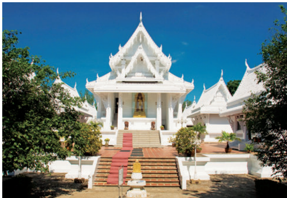
Wat Luangpho Sot Thammakayaram

The temple was named Wat Ko San Phra since it was formerly surrounded by a canal. However, the original name of the temple had a different spelling in Thai: วัดเกาะสานพระ, but the same pronunciation: Wat Ko San Phra. (-San-means to weave.) Later, its name was changed and it has been called Wat Ko San Phra with the spelling วัดเกาะศาลพระ (-San-here refers to a shrine) until now. One of the interesting monuments includes an old ordination hall. It was told that the principal Buddha image in the hall was built following the ancient tradition, made of woven bamboo, lacquered, and gilded. For further information, please call Tel. 08 4570 7299