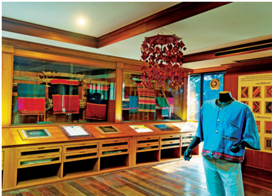
Chipathaphan Sathan Ban Khu Bua

recreation where the statue of King Rama I is situated for people to pay homage and commemorate.