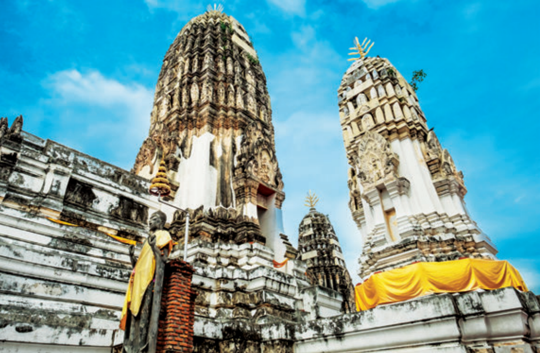
Wat Mahathat Worawihan

the gesture of subduing Mara, which has a lap width of 8 Sok 1 Khuep. Its characteristic is of the Pre-Ayutthaya art, with a Sukhothai style face. It has a long body but short knees. He turns his face to the east, and there is another Buddha image behind his back, turning its face to the opposite side or the west. This means we ask the Buddha's blessing to prevent danger from the front as well as the back. Thus, it is also called Phra Raksamueang—city's protective Buddha—along the belief of people in the Ayutthaya era. In front of the Wihan, there is a boundary wall made of laterite.