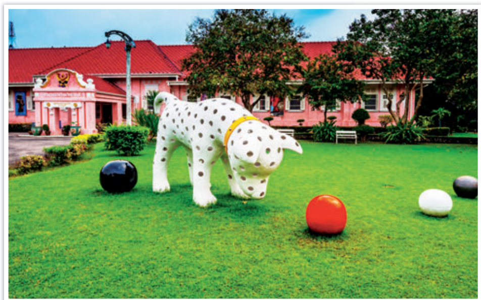
Ratchaburi National Museum

Saduak) at Tel. 0 2894 6355, the first bus departs at 5.50 a.m. (every 40 minutes) taking about 2 hours. Get off the bus at the Damnoen Saduak Floating Market. For more information, contact the Southern Bus Terminal at Tel. 0 2894 6122 or www.transport.co.th .