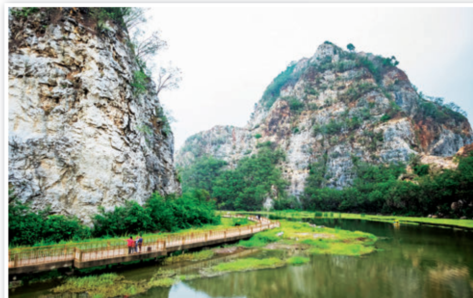
Khao Ngu Stone Park

Tham Fa Tho is located near Khao Ngu Park, about 250 metres west from Tham Ruesi Khao Ngu. On the southern wall, there are reliefs of a massive reclining Buddha image underneath a gathering of gods, and tree. In the north, there are reliefs of the Lord Buddha's two followers. The composition of sculpture in this cave is like that in Tham Cham, which depicts the scene when the Lord Buddha passed away to Nirvana. The festival to pay respect to the Lord Buddha is held every year on the first day of the waxing moon of the eleventh lunar month. Near the