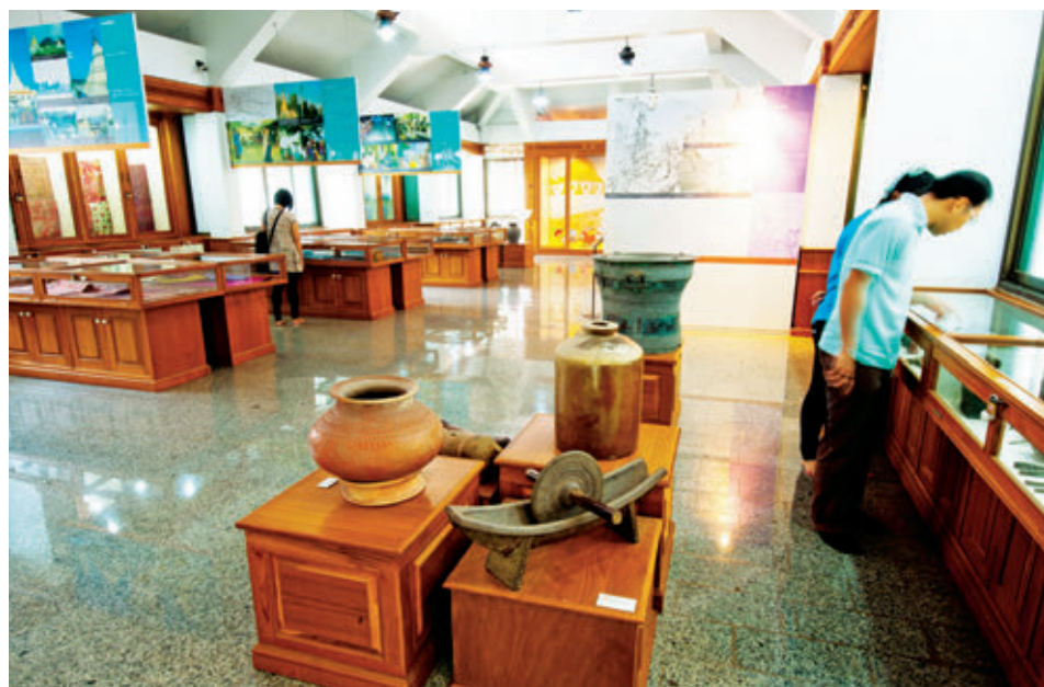
Wat Muang Folk Museum

is situated inside Wat Muang, in Tambon Ban Muang, on the Mae Klong riverside. From the history inscribed in palm-leaved books with Mon script, Wat Muang was an old temple constructed near the end of the Ayutthaya era. At that time, most people in the Ban Muang community and along both sides of the Mae Klong Basin were Mons, living with other ethnic minorities such as Thai, Chinese, Laotian, Vietnamese, Khmer and Karen. There was an integration and exchange of different cultures until it formed the identity of the local people. In addition to the close relationship between people's culture in Ban Muang community and