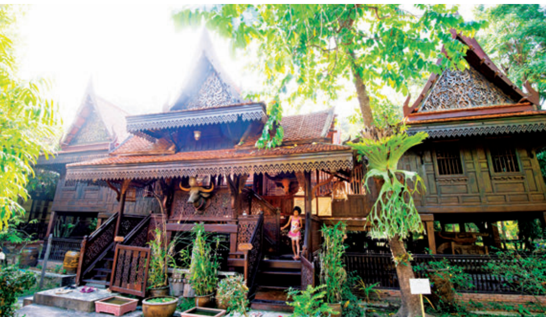
Phawothai Local Museum

Depart from Amphoe Suan Phueng about 5 kilometres, until you get to the intersection leading to the Bo Khlueng Hot Stream. Go straight on for 10 kilometres. Bo Khlueng is a natural hot stream whose water source is from the Tanao Si Mountains. The water flows all year and it is pure hot water with a temperature of 120-136 degrees Fahrenheit. In winter, in the morning, the hot stream will combine and form a terrific fog. A hot water well and natural hot water pond for bathing is available. The cost of mineral water bathing in the natural hot pool is 50 Baht for adults and 30 Baht for children. Bathing in the tiled pool costs 80 Baht for adults, and 50 Baht for children. It opens on Mondays–Fridays at 8.00 a.m.–5.00 p.m. and on Saturdays–Sundays at 08.00 a.m.–06.00 p.m.