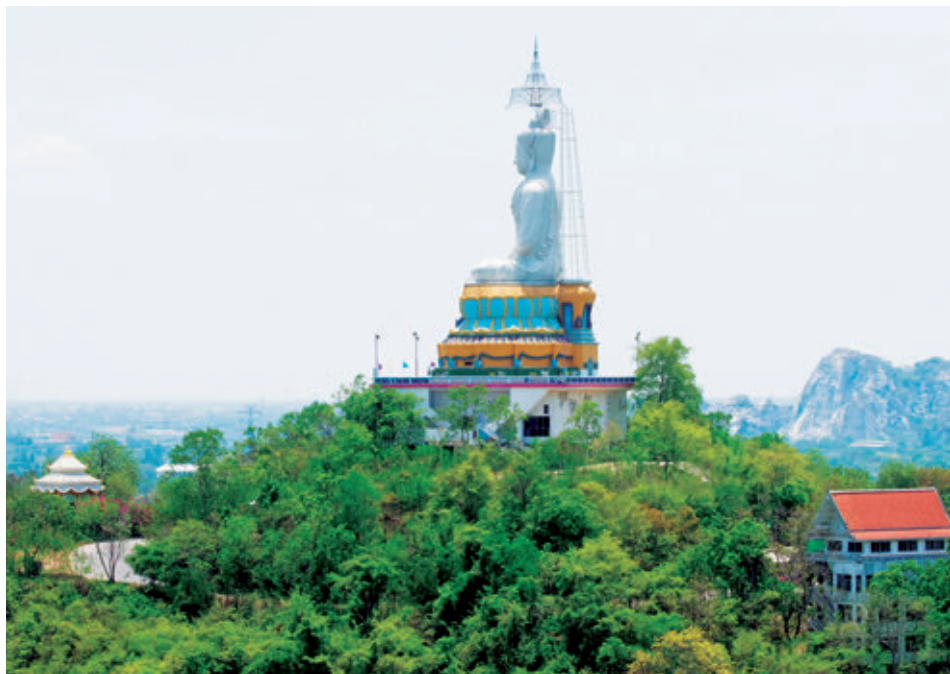
Wat Nong Hoi

Khao Ngu, there are also Tham Rakhang and Khao Phrabat, on the top of which the Lord Buddha's footprint is located and which is the sight-seeing point of Khao Ngu.