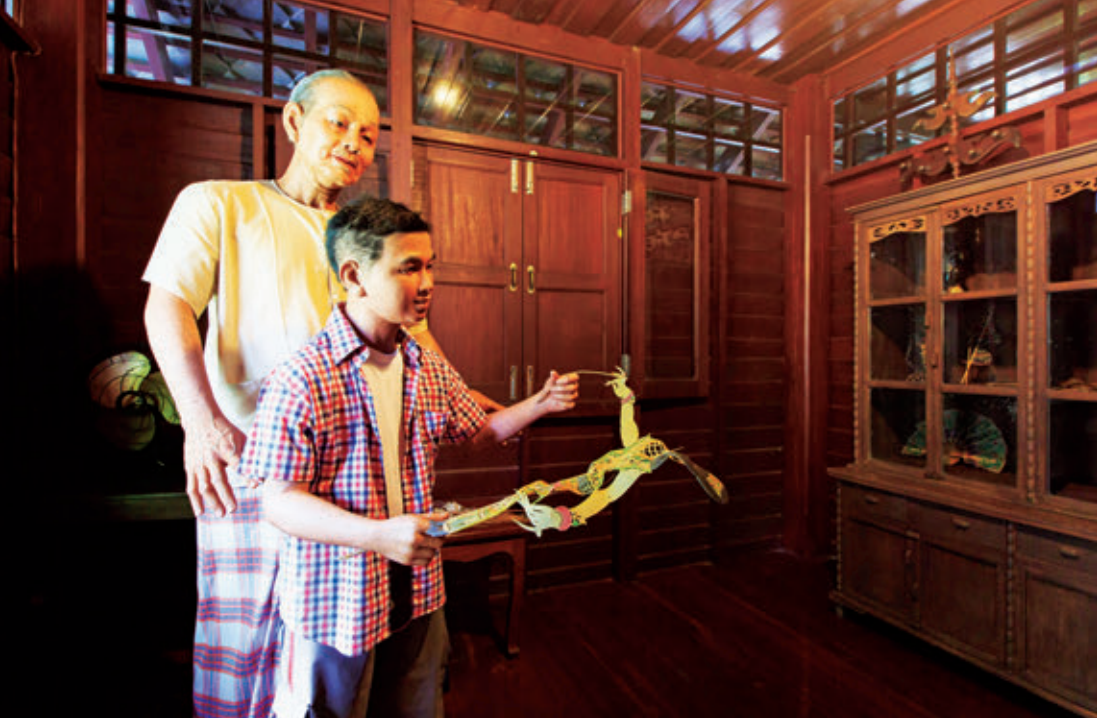
Siam Cultural Park

Saduak Floating Market. For more information, Tel. 0 2894 6355.