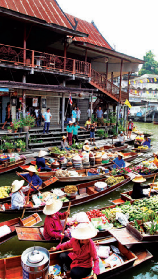
Khlong Lat Phli

small rowing boats which contained necessary products for living. We could see tradesmen, who dressed in dark-coloured clothes with a hat made of palm leaves like farmers, rowing boats to sell and exchange products in the period when the waterway was the main transportation route. Damnoen Saduak Floating Market opens early in the morning until noon. Wat Prasatsit Floating Market, where we still can see traditional ways of life, opens early in the morning until 08.00 a.m. The most suitable time to visit the market is from 08.00-12.30 hrs. For more details, please contact the Tourism Public